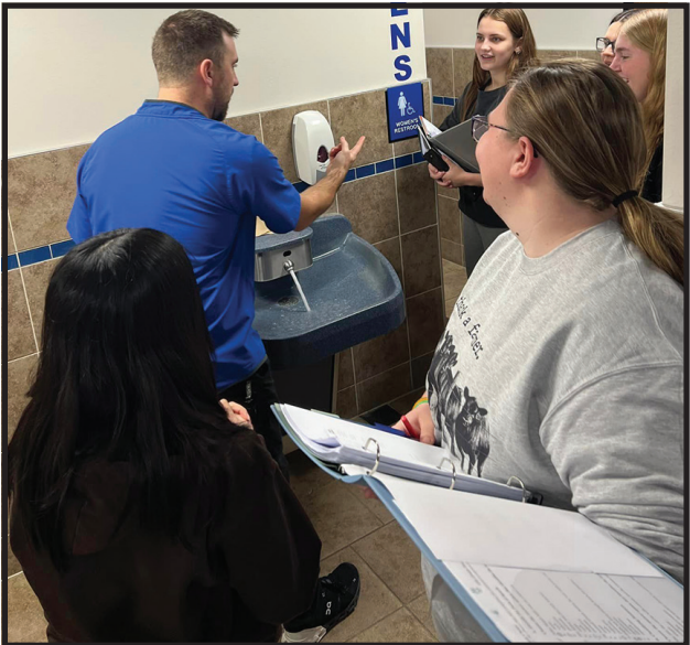
A little CNA class fun: teaching student and staff proper hand washing and learning the Heimlich. No one was injured in this lesson :)