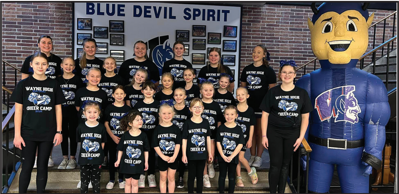
Wayne High Cheerleaders had a great time holding Cheer Camp for future cheerleaders in January!