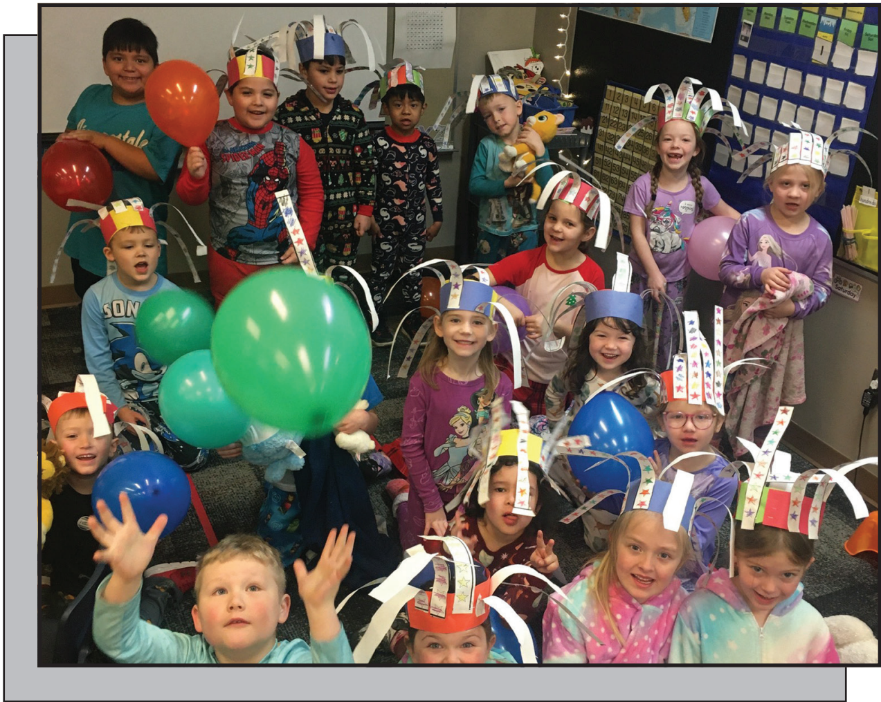
Many of the Elementary classes celebrated 100 Days of School! Some classes built things with 100 objects, made Fruit Loop necklaces, and made funny hats!