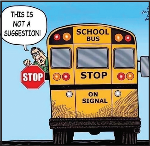
Please be mindful of ALL the buses carrying our students!!